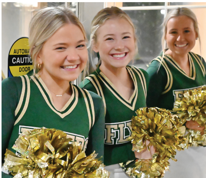
LHS Cheerleaders greet the Community Breakfast guests as they enter Sunset Country Club.