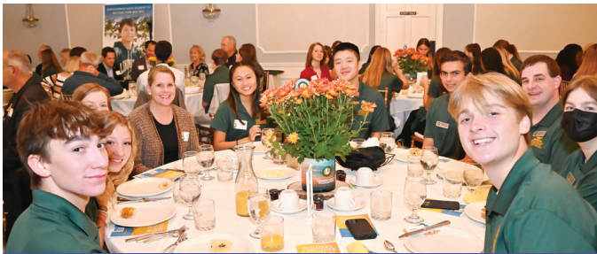
Junior Board members were guest speakers, and helped greet guests at the Community Breakfast.