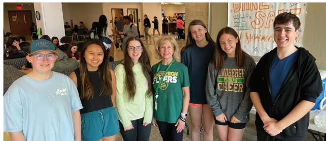
Junior Board members held a bake sale and raised over $400 for LLTW Summer Cafe Program.