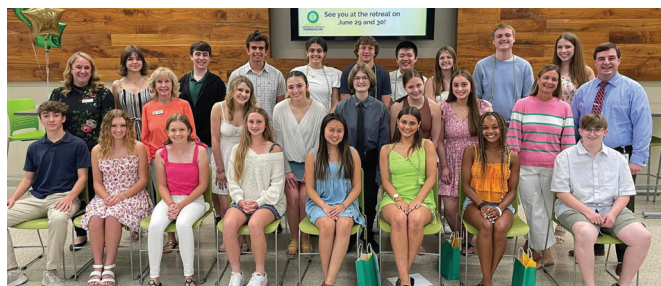
End of the Year Junior Board Banquet. We said goodbye and celebrated our seniors!