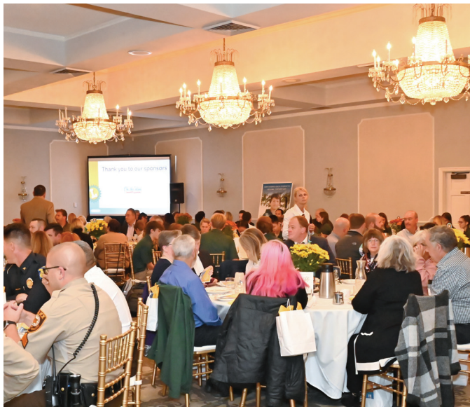
The crowd of Lindbergh Foundation supporters fill the room for the 3rd Annual Community Breakfast.