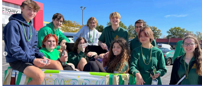
The Junior Board led the Crestwood 75th Anniversary Parade.